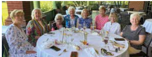
Bryn Mawr class of 1959