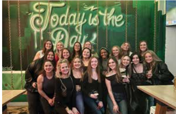
Bryn Mawr class of 2019