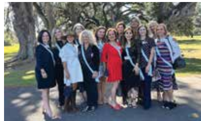
Grand Coteau class of 1984