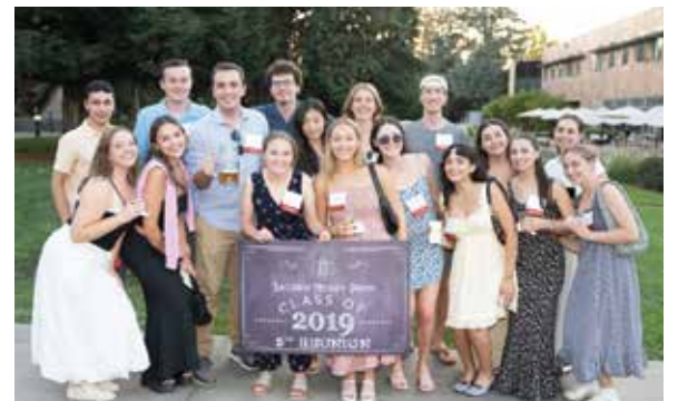
5th Sacred Heart Prep class of 2019