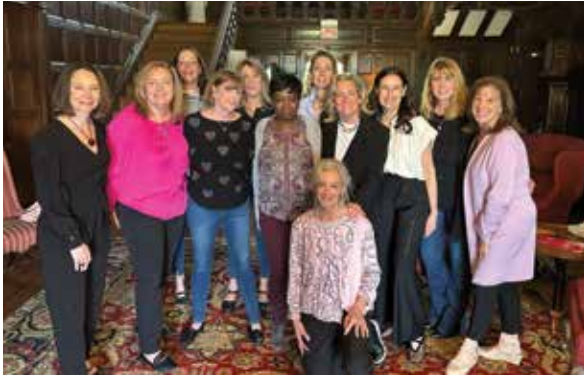
Bryn Mawr class of 1983