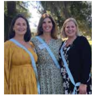
Grand Coteau class of 1994