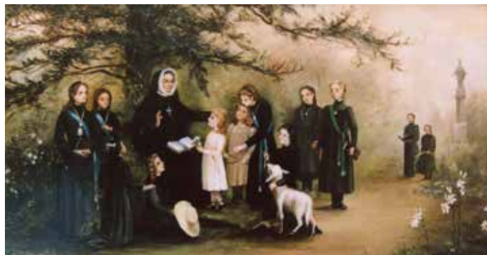
Presenting flowers upon St. Madeleine Sophie’s visit.