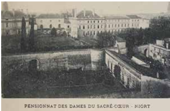
Ladies boarding school of the Sacred Heart - Niort CSH Niort journals of St. Madeleine Sophie Barat