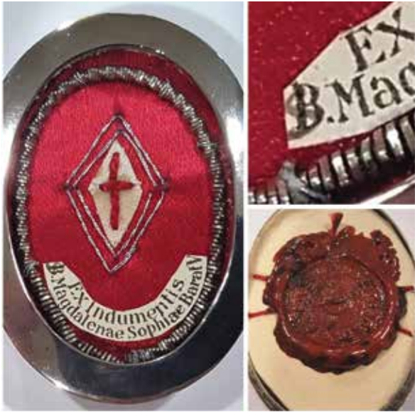
Relic of St. Madeleine Sophie's habit, 1925

When I later took these relics to one of my CSH archivist contacts, she pointed out that this particular relic (“Ex Indumentis” is Latin for “from the clothing”), originally created to commemorate the Beautification of Madeleine Sophie Barat (“B”) was hand corrected in the year of her Sanctification, May 25, 1925 as noted by the overwritten “S” on the label inscription. This corroborated with my family’s port of arrival records back to the U.S. from France later that year. The “signum” on the inside back is the sealing wax that the Cardinal in charge placed on the relic to certify and testify to its authenticity. It is approximately 3 cm x 4 cm. When I brought these relics to the 2017 San Francisco conference, many expressed that they had never seen anything like them before which made sharing them amongst the Sacred Heart community even more special.