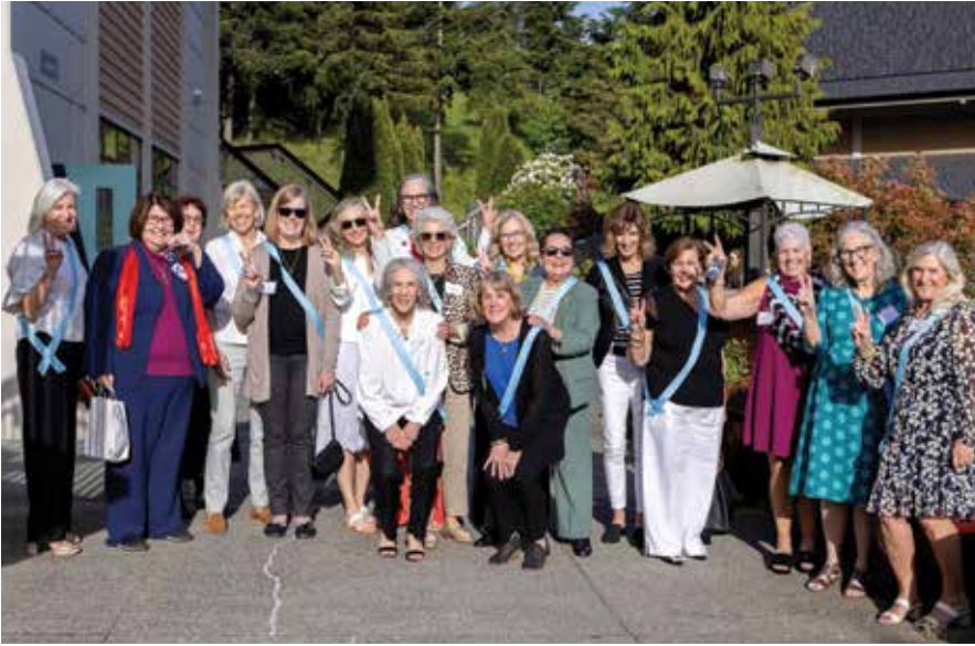
Forest Ridge class of 1974