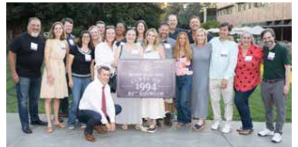
30th Sacred Heart Prep class of 1994