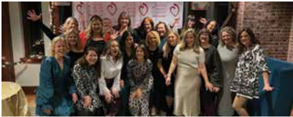
Bryn Mawr class of 2004