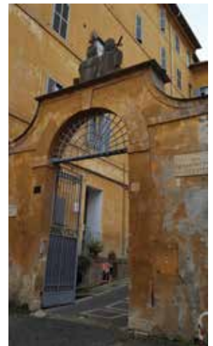
Istituto Sacro Cuore Villa Lante, Trastevere, Italy