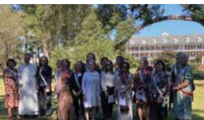
Grand Coteau class of 1974