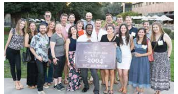
20th Sacred Heart Prep class of 2004