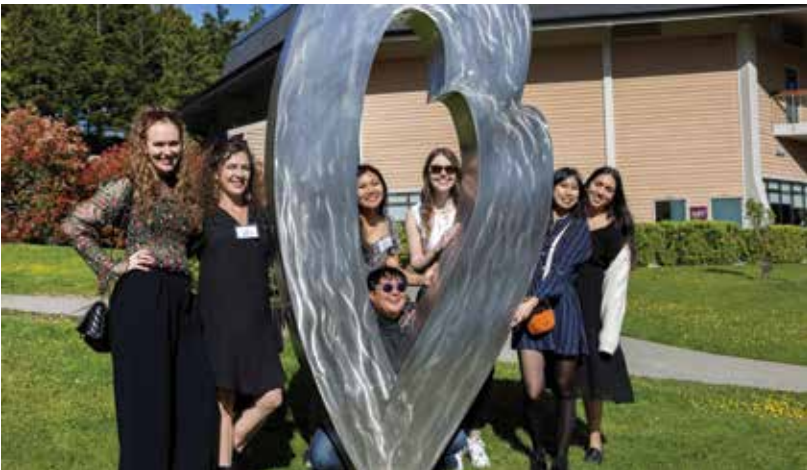
Forest Ridge class of 2014