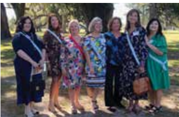
Grand Coteau class of 1979