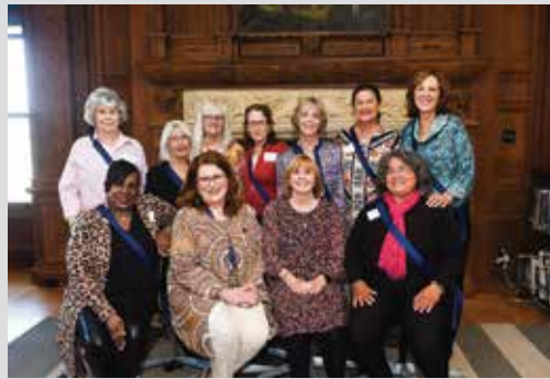
Convent High School Class of 1971