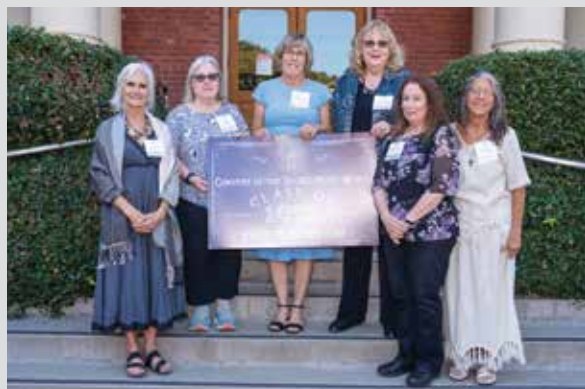
Atherton Class of 1972