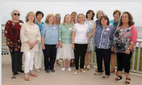
Elmhurst Class of 1972