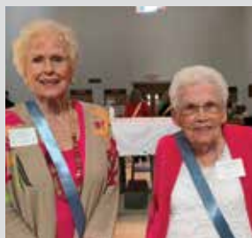
ASH St. Charles Class of 1950