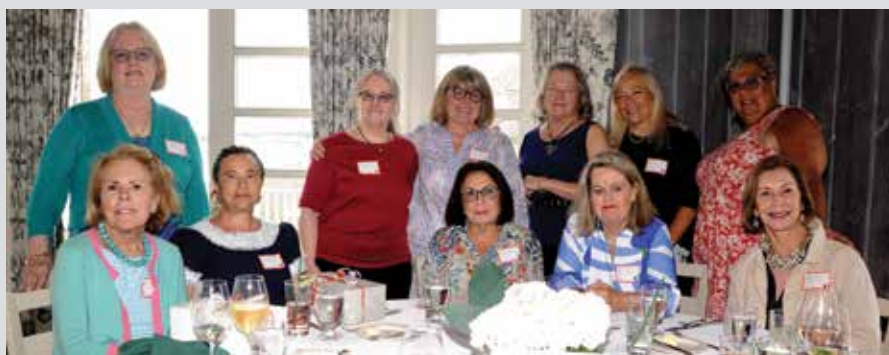
Elmhurst Class of 1971