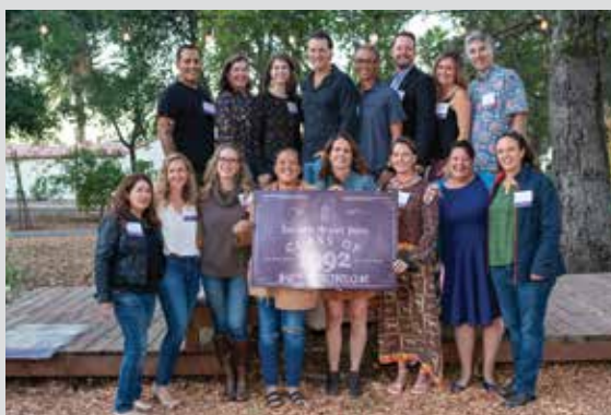
Atherton Class of 1992