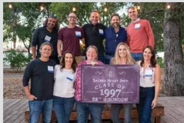
Atherton Class of 1997