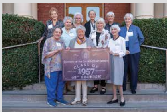
Atherton Class of 57