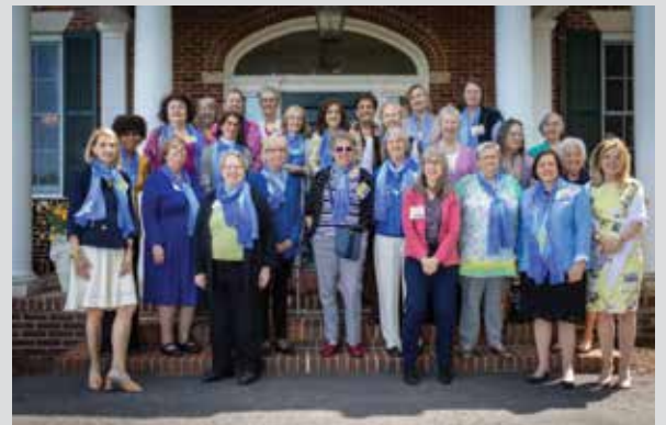
Stone Ridge Reunion