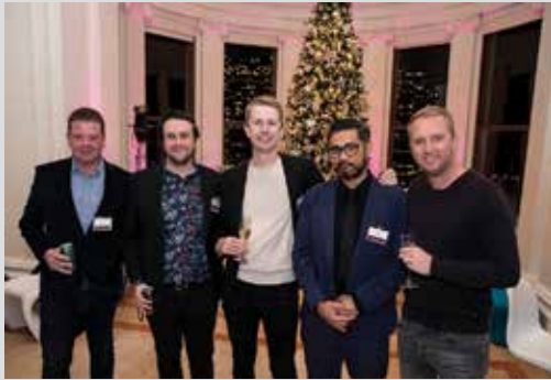
Convent and Stuart Hall Alumni Cocktail Party 2022