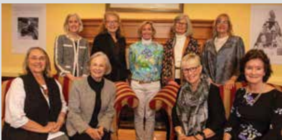
Newton Country Day Reunion Class of 1975