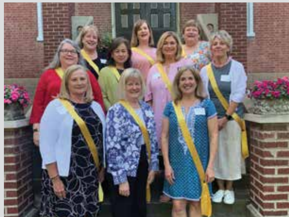
ASH St. Charles Class of 1972 8th Class