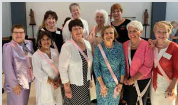
ASH St. Charles Class of 1962