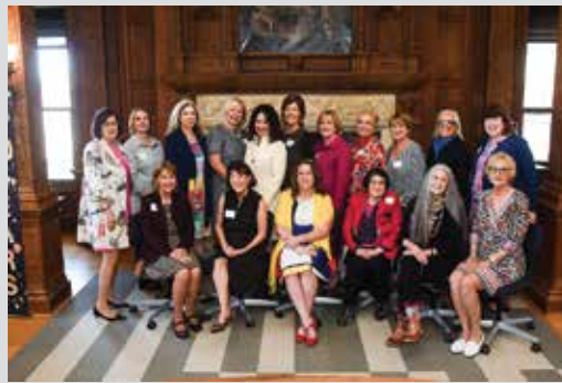
Convent High School Class of 1972