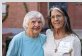
Atherton Class of 1972