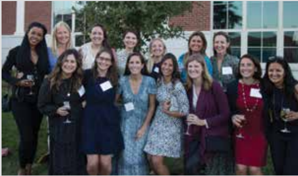
Greenwich - 20th reunion