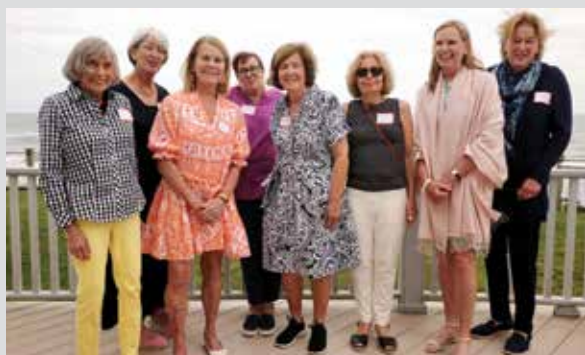
Elmhurst Class of 1970