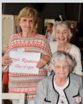
Elmhurst 70th Reunion Class of 49 and 50