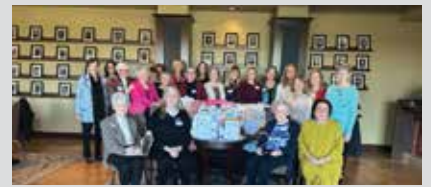
Arizona Association Luncheon