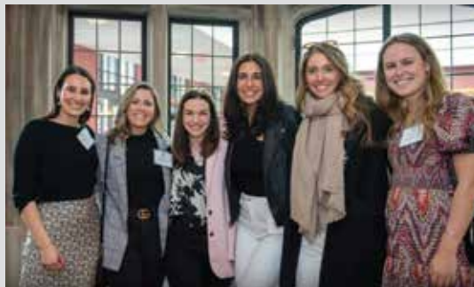
Newton Country Day Reunion