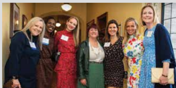
Newton Country Day Reunion