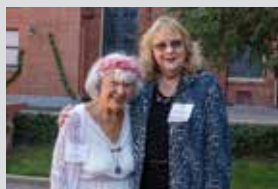
Atherton Class of 1972