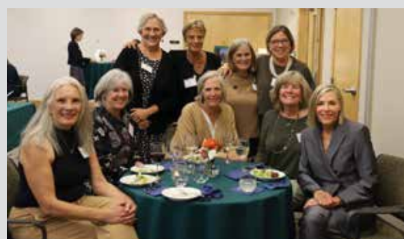
Forest Ridge Class of 1969, 1971 and 1972