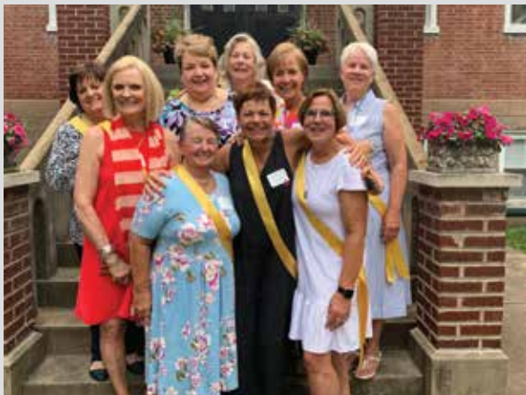
ASH St. Charles Class of 1972 12th Class