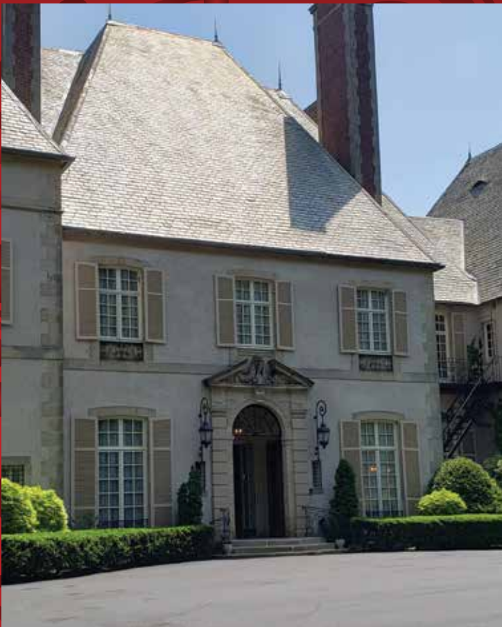
Above: Convent of the Sacred Heart, Elmhurst Left: Aerial view of St. Philomena School of the Sacred Heart