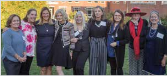
Greenwich - 50th Reunion