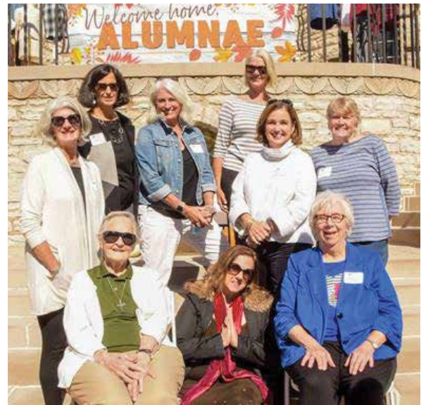
Villa Class of 1970