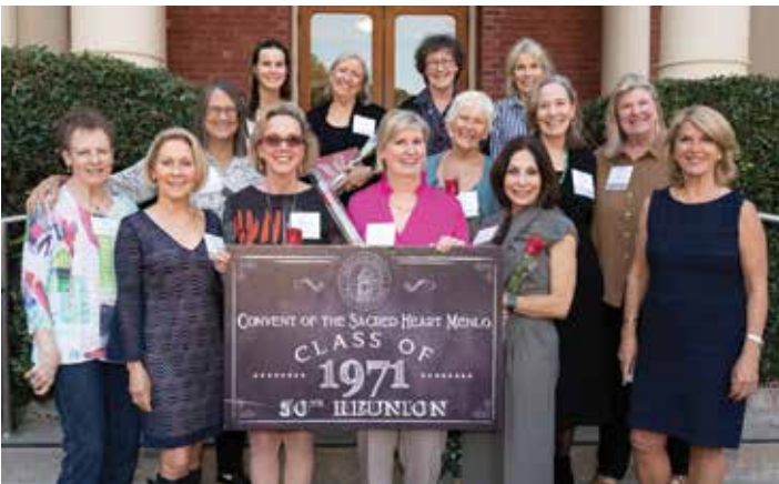
Atherton Class of 1971