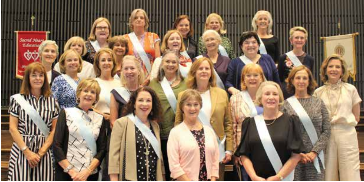
Rosary Class of 1971