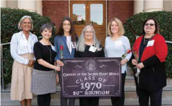
Atherton Class of 1970