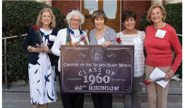
Atherton Class of 1960