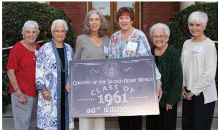
Atherton Class of 1961