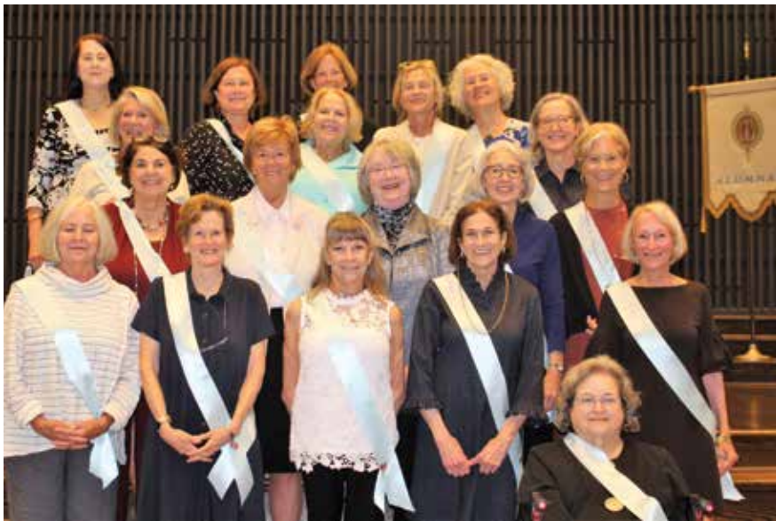
Rosary Class of 1970