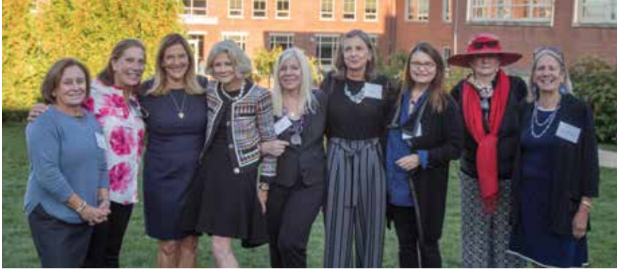
Greenwich Class of 1971