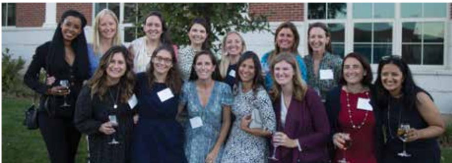
Greenwich Class of 2001