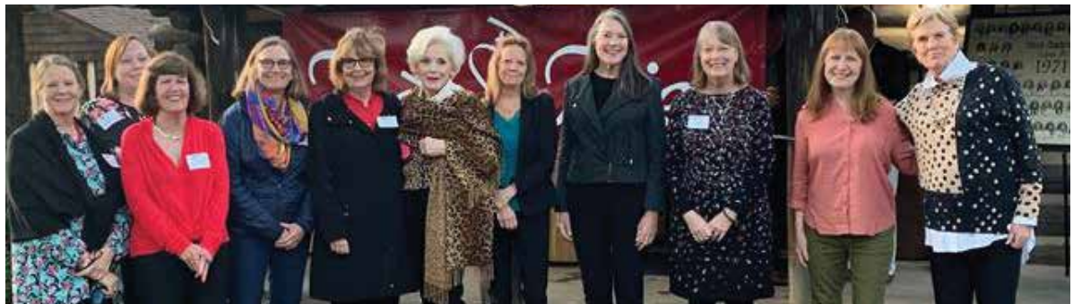
Villa Class of 1971