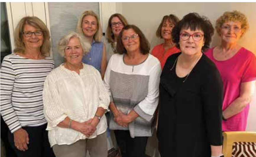
DASH Omaha Class of 1971