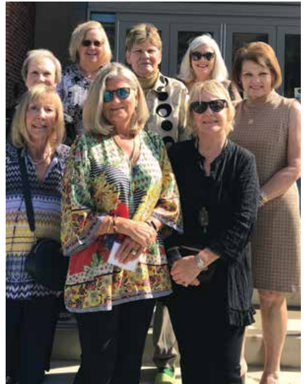
Stone Ridge Class of 1970