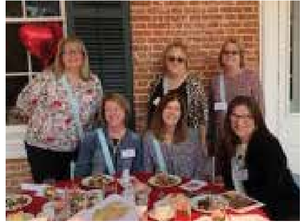
ABOVE: Grand Coteau Class of 1976