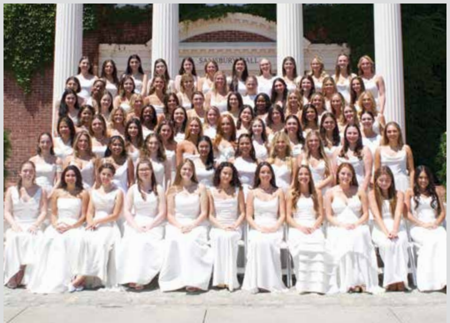
Sacred Heart Greenwich, Greenwich, Connecticut