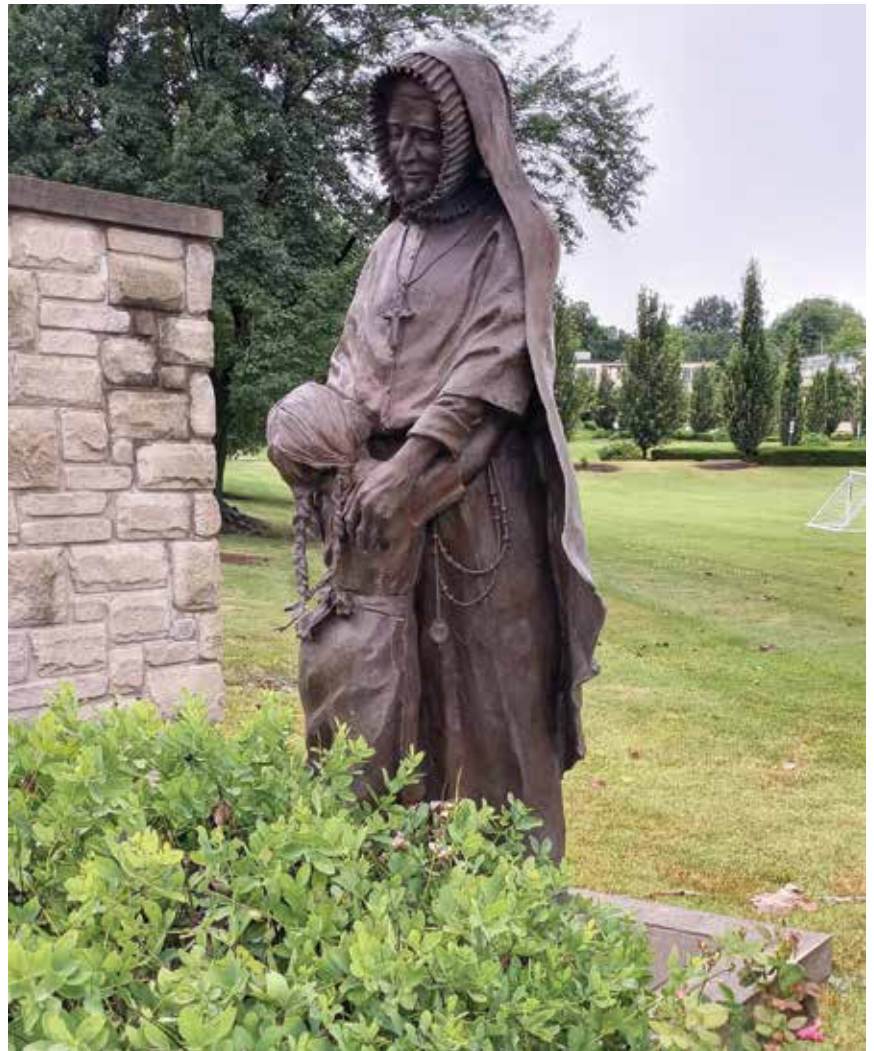
Statue on the grounds at AASH- St. Charles

from their traditional IRAs can contribute up to $100,000 directly to AASH without it being considered a taxable distribution. Contact your IRA administrator or the National Office ( nationaloffice@aash.org ) for more information.