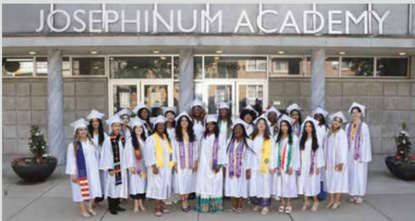
Josephinum Academy, Chicago, Illinois