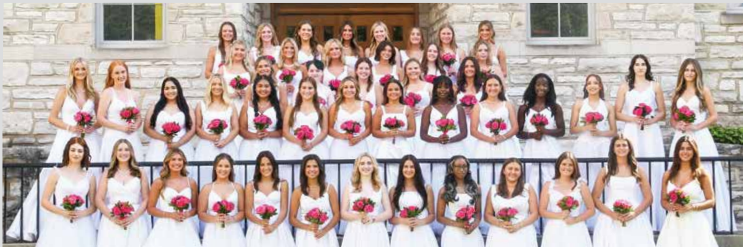
Villa Duchesne, St. Louis, Missouri