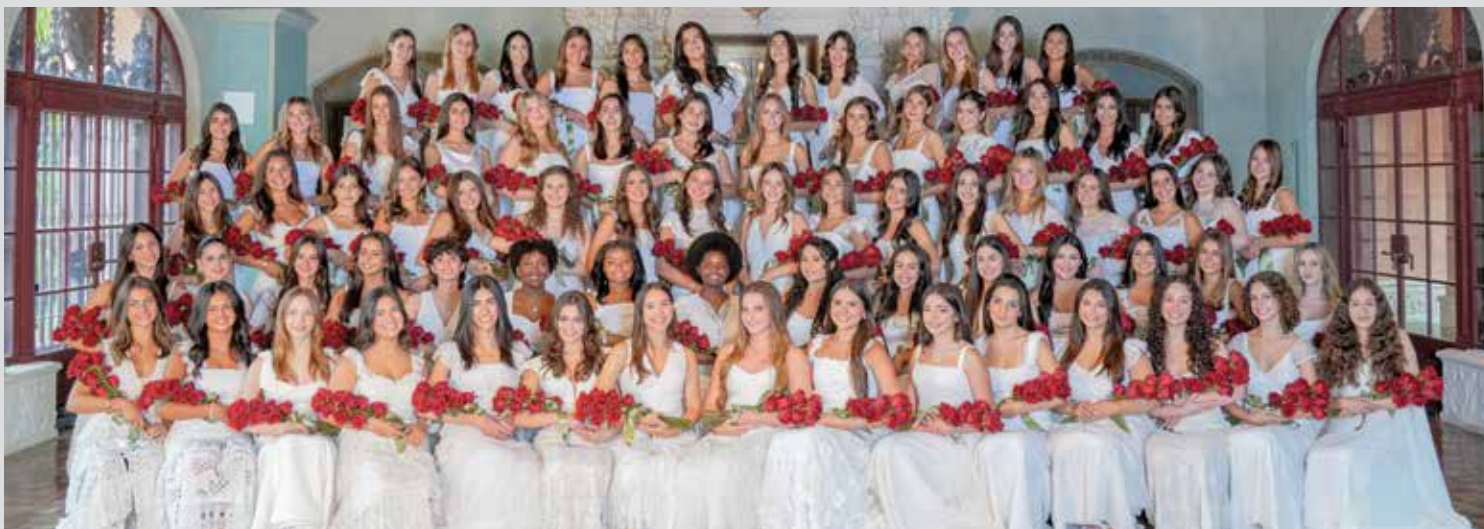
Carrollton School of the Sacred Heart, Miami, Florida