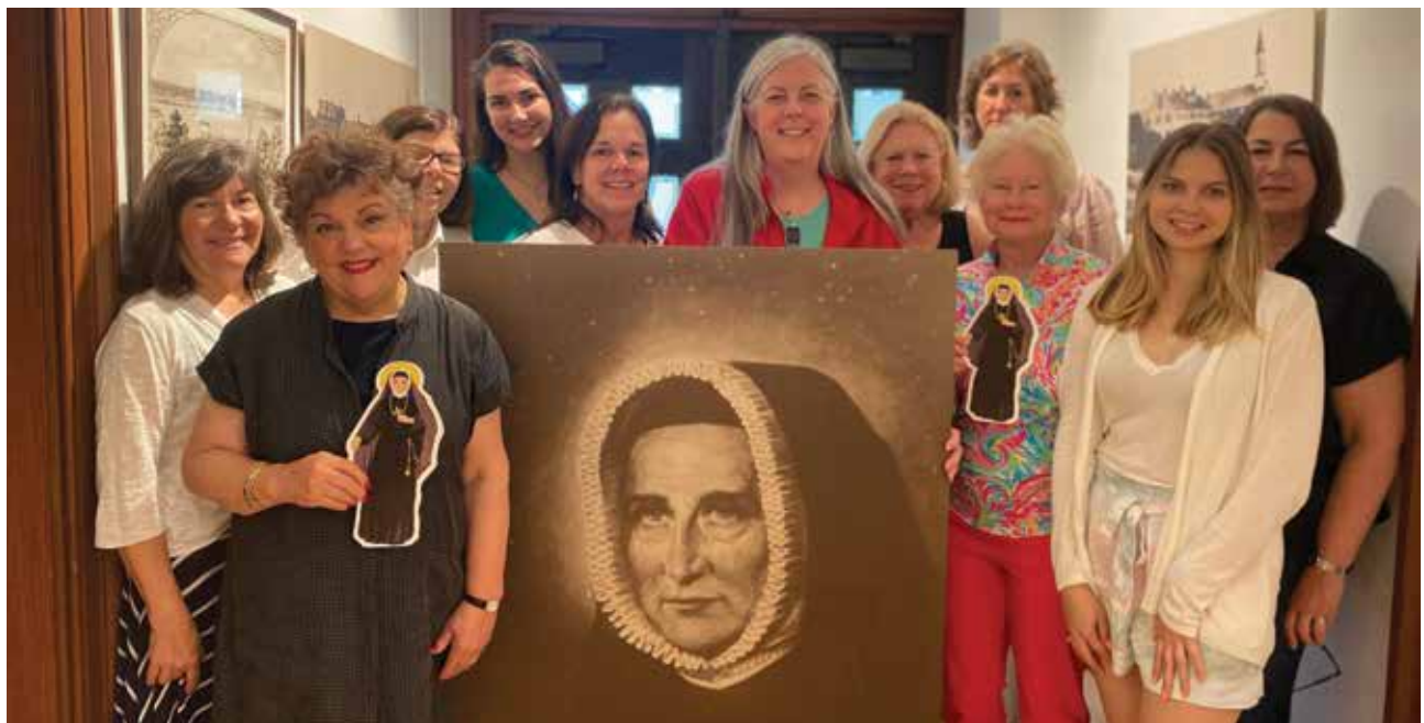
2023-2025 AASH Board and Staff