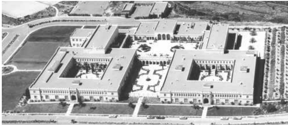
San Diego College for Women