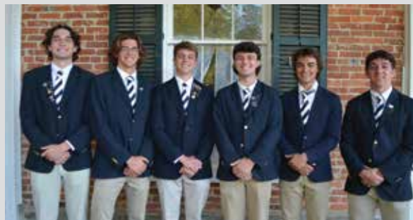
Berchmans Academy, Grand Coteau, Louisiana