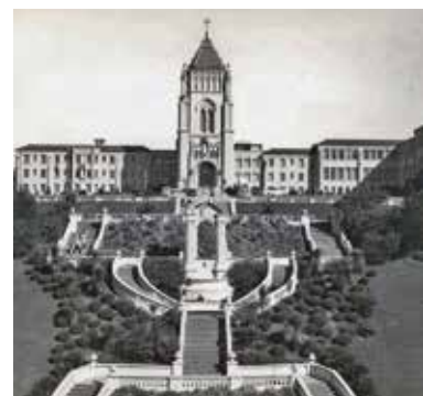
San Francisco College for Women, Lone Mountain