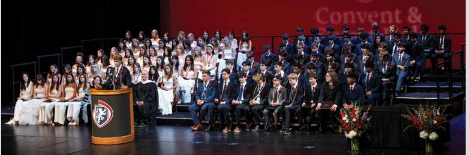
Convent and Stuart Hall, San Francisco, California