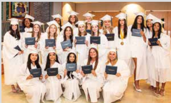
Bloomfield Hills, Michigan