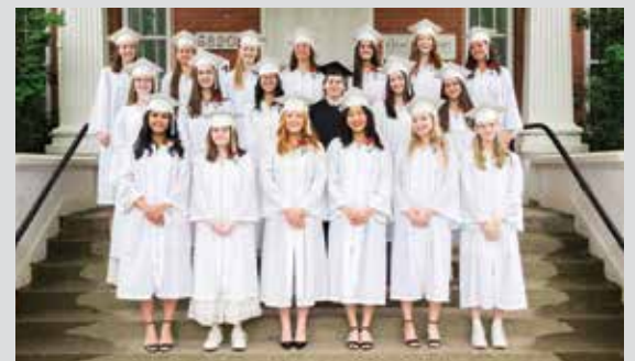
Barat Academy - Halifax, Nova Scotia, Canada