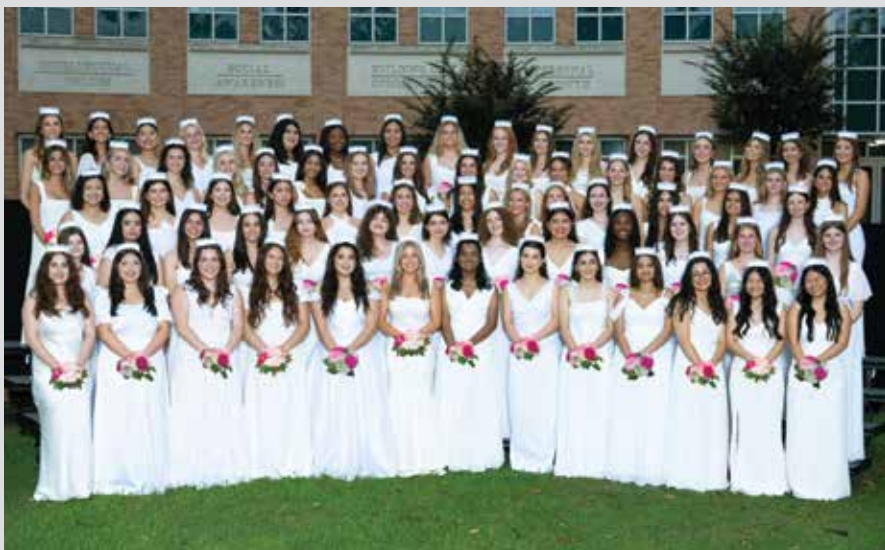
Duchesne Academy, Houston, Texas