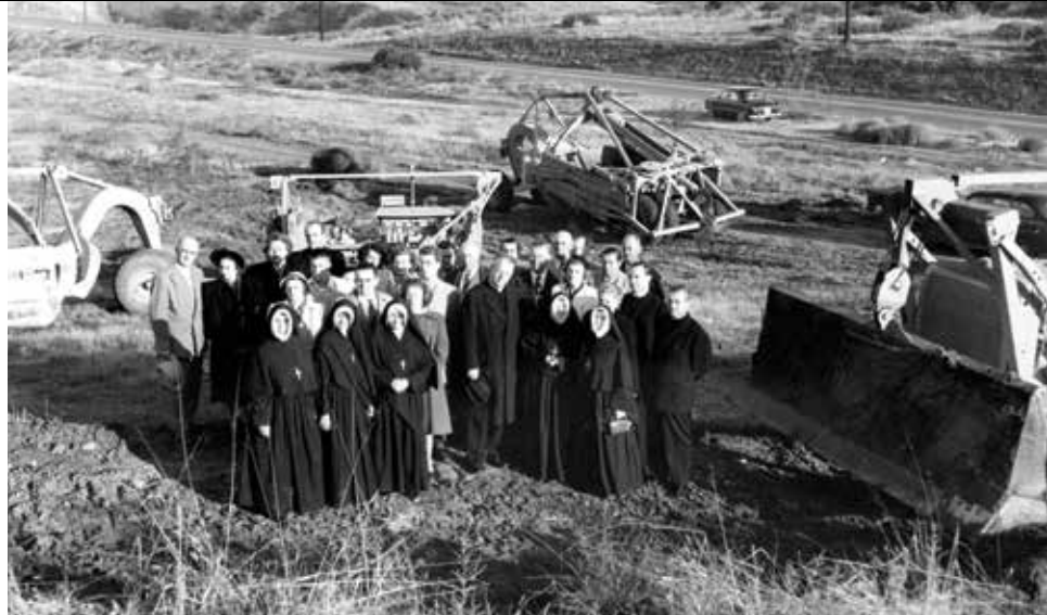
Groundbreaking at San Diego College for Women, 1949

Meanwhile, the Holy Spirit intervened with an extraordinary gift. Since 1909, The Convent of the Sacred Heart in San Francisco was located in the Van Arsdale House on Jackson Street.