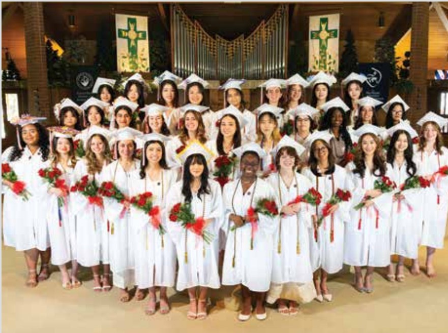
Forest Ridge School of the Sacred Heart, Bellevue, Washington