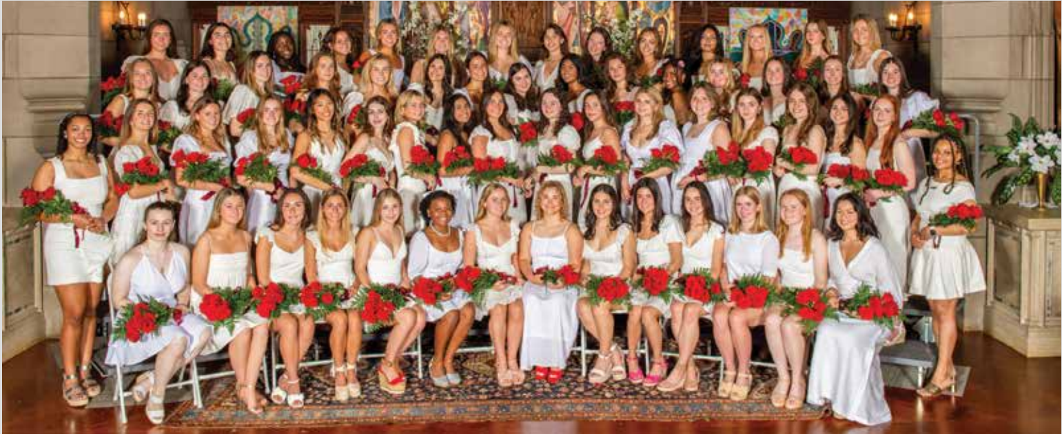
Newton Country Day School of the Sacred Heart, Newton, Massachusetts