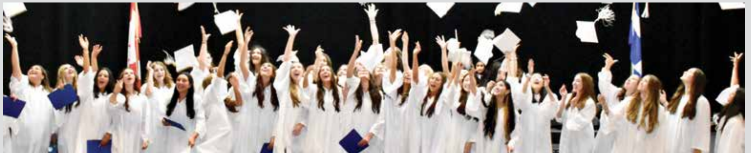
The Sacred Heart School of Montreal, Canada