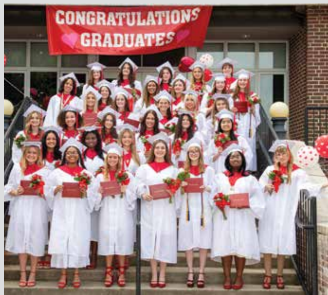
Sacred Heart Academy, Bryn Mawr, Pennsylvania