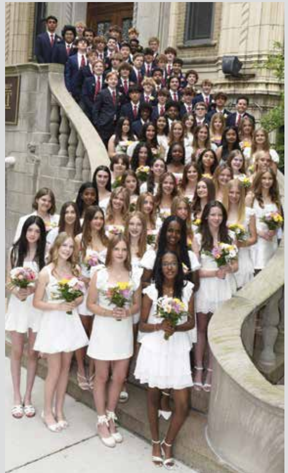
Sheridan Road, Chicago, Illinois