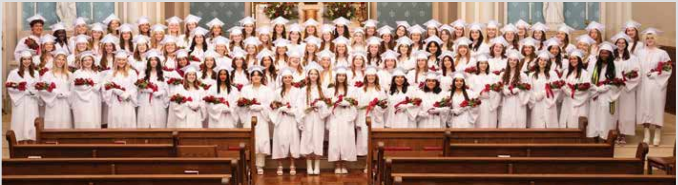
Duchesne Academy, Omaha, Nebraska