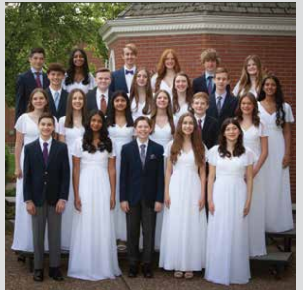
Academy of the Sacred Heart - St. Charles, Missouri