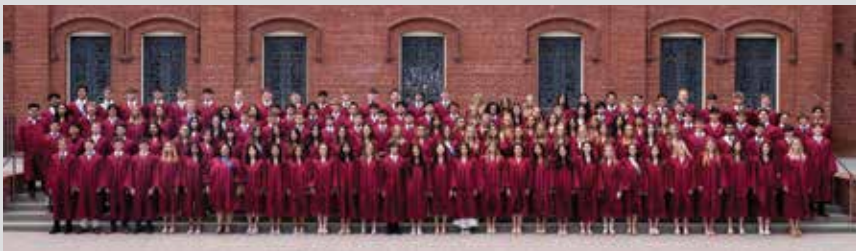
Sacred Heart Schools, Atherton, California