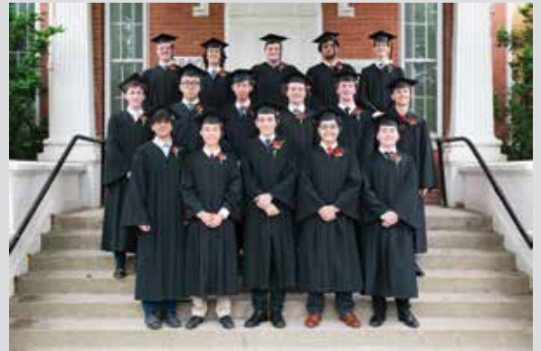
Fountain Academy, Nova Scotia, Canada