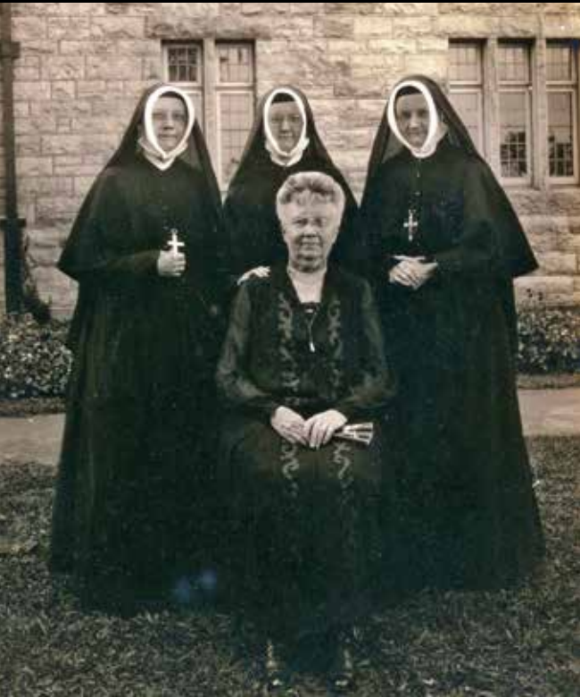
The “Mothers Hill” and their mother.