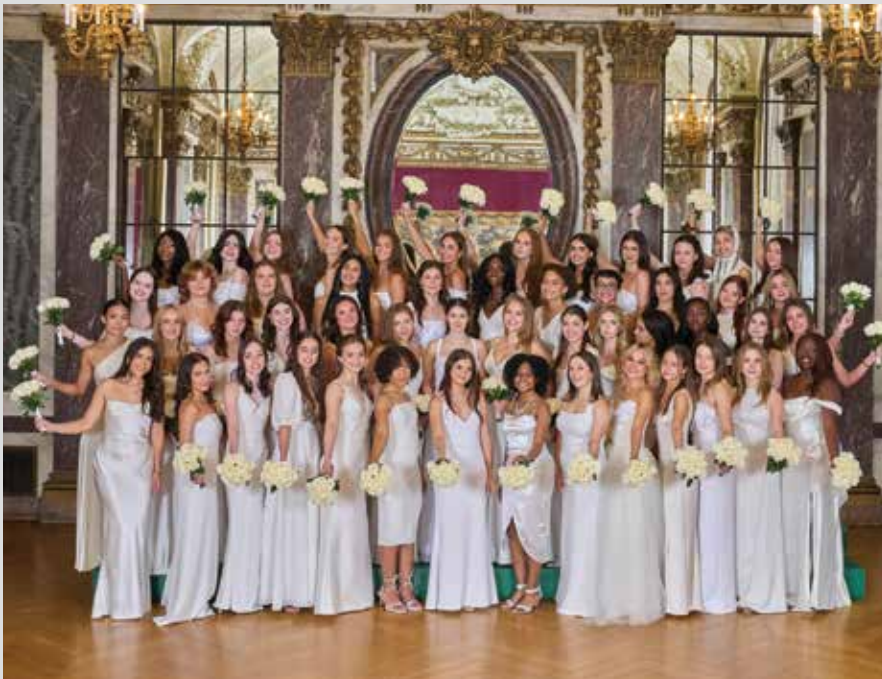
Covenant of the Sacred Heart, 91st Street, New York, New York