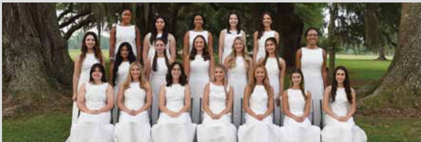
Academy of the Sacred Heart - Grand Coteau, Louisiana