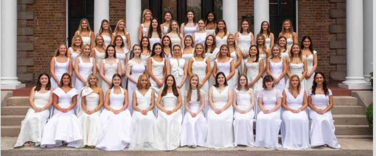
Academy of the Sacred Heart - Rosary, New Orleans, Louisiana