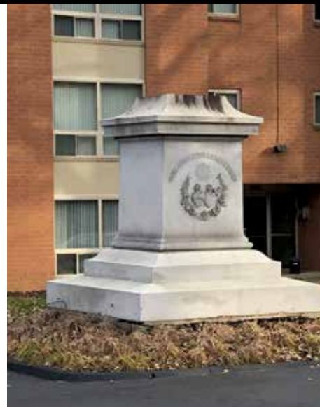
View of the pedestal at the West End Terrace Apartments before it was moved.

Villa Duchesne invites anyone passionate about St. Louis history, or who simply wants to see the pedestal and learn more to reach out to the staff or alumnae. As a historic symbol of spiritual enlightenment and a landmark for education west of the Mississippi, this pedestal is a meaningful relic that ties generations of young scholars together.