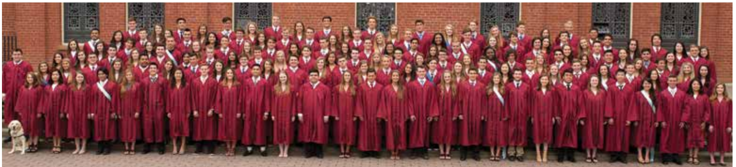
Members of the Class of 2017 from Sacred Heart Preparatory in Atherton, California.