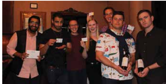
Young alums were out in force at the National Conference. A happy hour drew dozens of people and they were just as eager to kick off their shoes and boogie as everyone else at the gala Saturday evening.