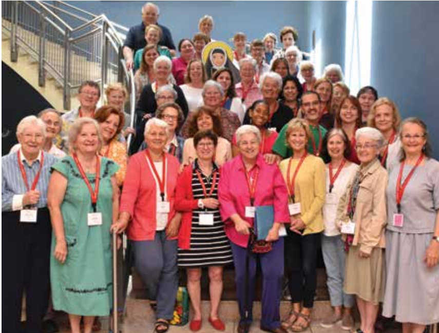
A group of Spirituality Forum attendees pose with a life-sized Flat Philippine at St. Louis University. More than 360 people from 24 countries gathered in St. Louis in July for a deep dive into the spirituality and legacy of St. Philippine Duchesne. Participants were invited to cross new frontiers - intellectually, emotionally and spirituality.