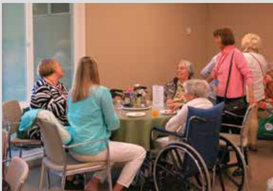
Alums and Religious visit at the Oakwood retirement community on the Atherton campus. Two busloads of conference attendees pulled up to the community on a sunny afternoon and were welcomed with open arms - and hugs and kisses and lots of laughter. Alums and nuns were thrilled with the chance to catch up and reminisce together.