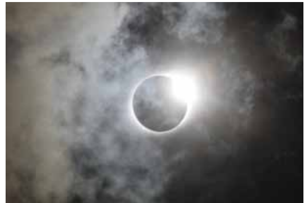
The so-called "diamond ring" effect, as the sun begins to emerge from behind the moon. August 21, 2017.

This summer we kicked off the Bicentennial of St. Philippine's arrival in the New World. As part of the celebrations, a life-sized statue of St. Philippine has been commissioned for the grounds of the Saint Louis Cathedral. AASH has pledged $7,500 toward the statue. Our money will pay for two bronze benches – one on either side of St. Philippine – that are an integral part of the installment, where pilgrims may sit and converse or pray with her. The statue