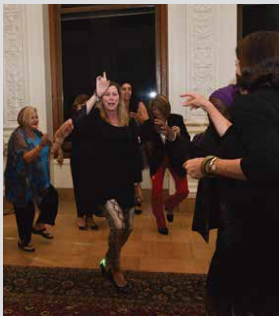
The Flood Mansion Gala ended with a dance that saw alums joyously kicking up their heels – and kicking off their shoes – for classics such as “YMCA” and “Shout.” The 80s music was a particular hit among alums of all ages!