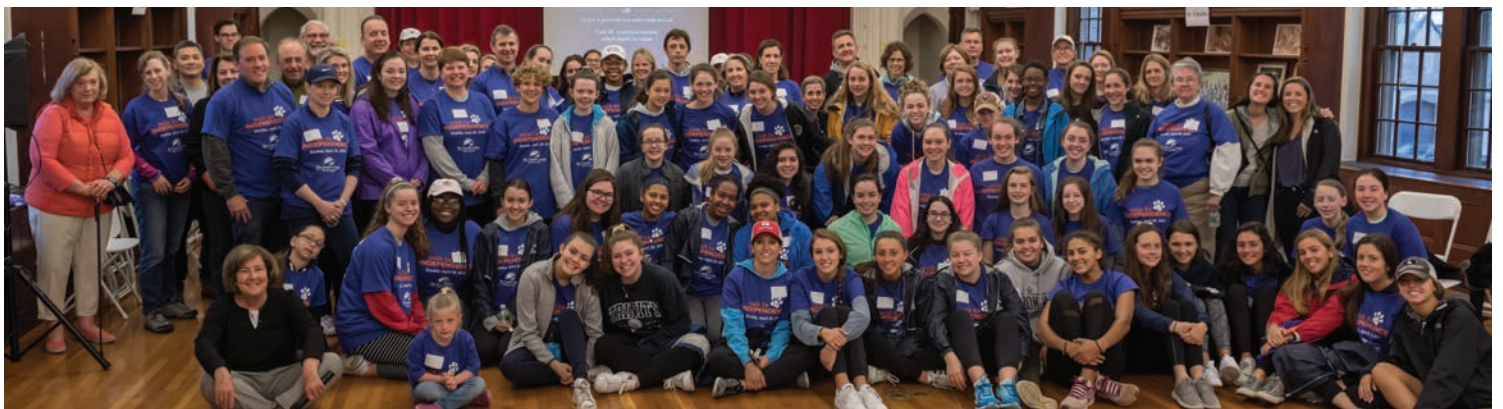
Newton Country Day