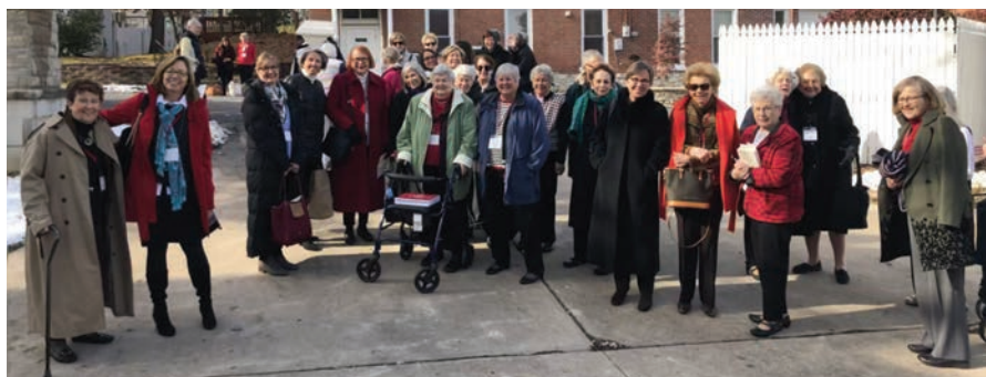
There was some unplanned excitement at the Regional when a small fire broke out in the school office. Attendees took a quick break in the cool sunshine before the fire department gave the all clear and they returned to the meeting.