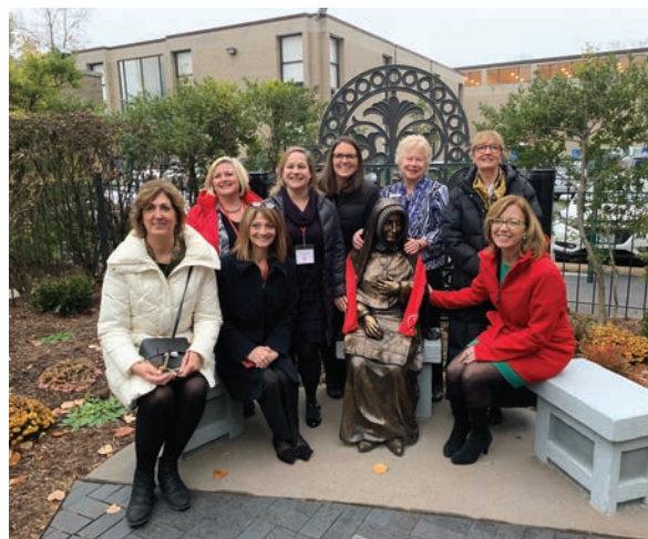
Members of the AASH Board pose with St. Philippine.

See more photos from the regional meetings on the inside back cover.