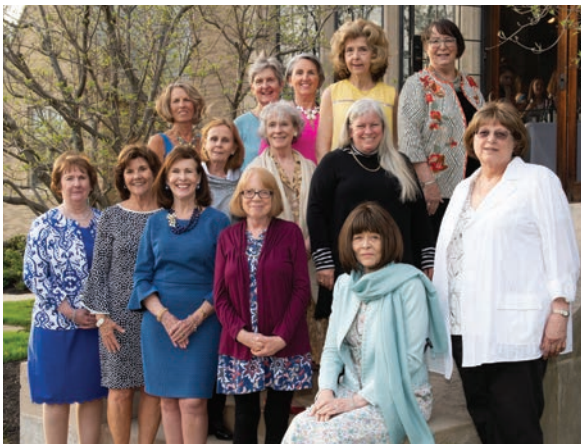
Newton Country Day