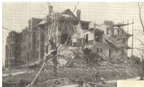
Easter Sunday, 1913 a devastating tornado struck Omaha, leaving Duchesne in a state of near destruction.

Today, Duchesne Academy is noted for its historic past and its academic future. New additions to the school have created a renewed landmark in Omaha: from the devastation of a tornado has risen a true Treasure of The Heart.