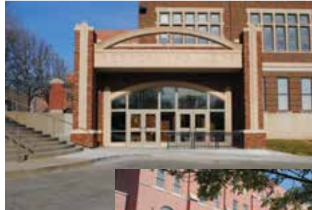
Two top photographs show the state-of-the-art Convent of the Sacred Heart Duchesne Academy as it is today -- welcoming the 39th Biennial AASH Conference and showing off its new addition.

In the first 10 years enrollment grew to 150 students. A life-