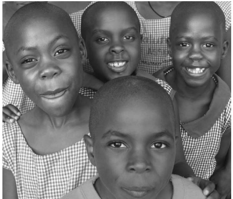
$450 a year provides a quality Sacred Heart education for these precious girls including, tuition, room and board, uniforms, a gingham dress for the evening and lots of love.

All this in our first morning! Over the next two weeks I learned so much from the deep faith of these young girls, their drive to learn and their care for one another. Our workshops with their teachers and RSCJ were an amazing window into cultural differences and the love of Sacred Heart education that brought us together. I am filled with hope and gratitude for these talented educators and the wisdom they have shared with me.