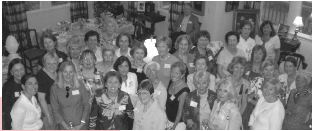
A crowd gathered in Plymouth for the first event for the new Southeast Massachusetts, Cape Cod & the Islands Alumnae/i Association.

Associations, it's easy to find in your region! For more information, contact us with an association,