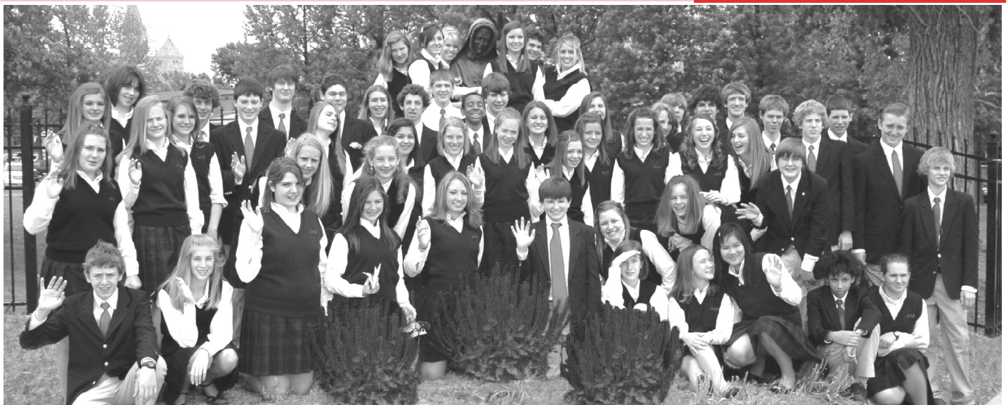
The young men and women of the Class of 2008 at the Academy of the Sacred Heart, St. Charles, Mo. are some of our newest grade school alums. The 56 graduates, gathered around a new bronze, life-size statue of St. Philippine Duchesne on the corner of the school grounds, are heading to 14 area high schools.