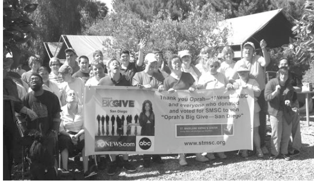
St. Madeleine Sophie's Center students gather around a banner to thank all those who helped them win BIG.

Scores of alums have participated in the Network of Sacred Heart Schools Summer Service Projects at StMSC. Each summer, a group of 15-20 high school students spend up to two weeks living on campus where they interact with and learn about people with developmental disabilities. For some of them, this experience influences their decision to pursue social services.