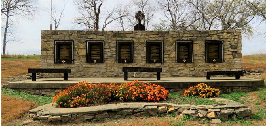
St. Philippine Duchesne Memorial Park, near Centerville