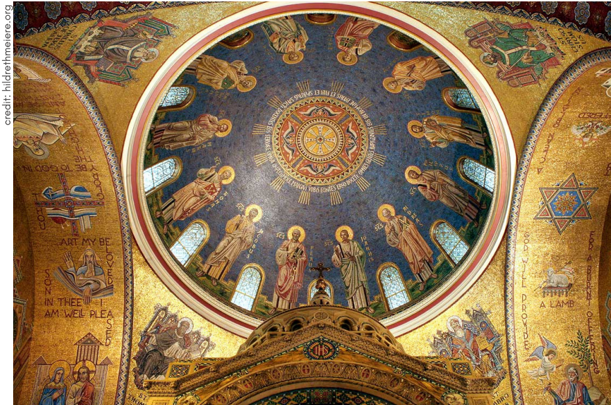
Dome of the Twelve Apostles, St. Louis Cathedral