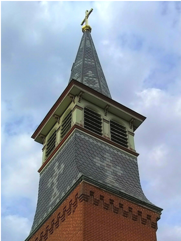
The church at Old St. Ferdinand