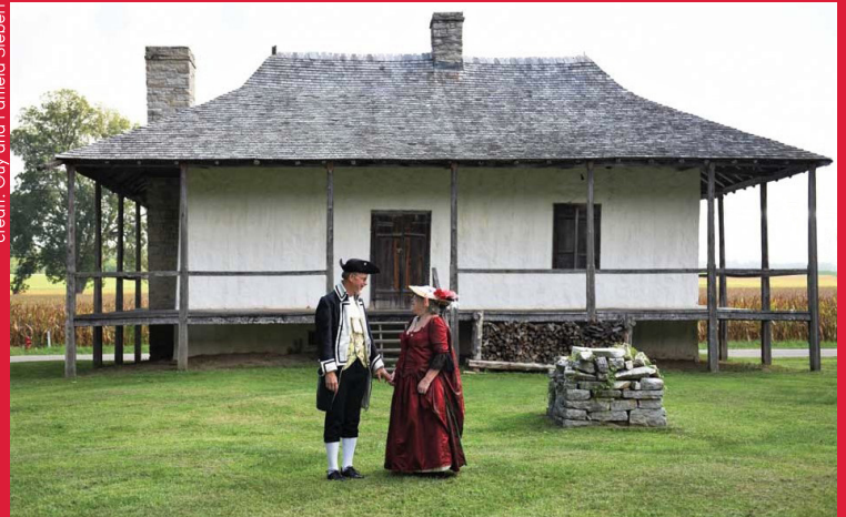
Maison Bequette-Ribault, a rare example of a "poteaux-en-terre," or post-in-ground, construction

CONTACT: AASH is pleased to present a series of tours—in the United States and abroad—highlighting Sacred Heart history, heritage, and spirituality. If your group is interested in visiting one or more of the places on this suggested itinerary, please email nationaloffice@aash.org or call (314) 569-3948. We would be happy to work with you to organize a trip.