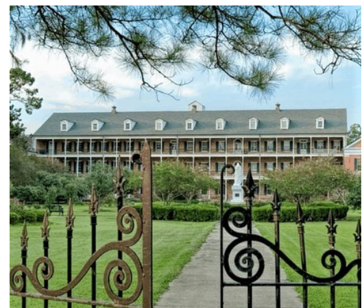
Academy of the Sacred Heart in Grand Coteau