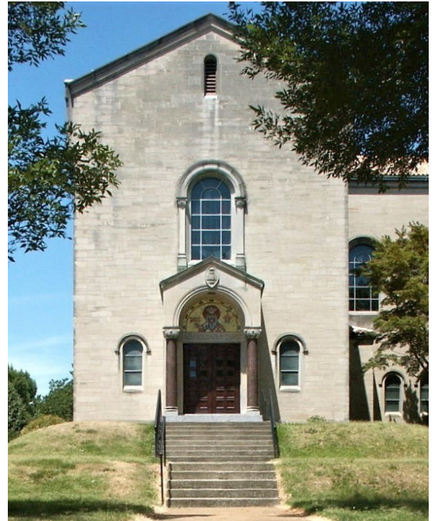
Shrine of St. Philippine