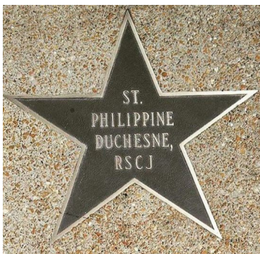
Walk of Fame