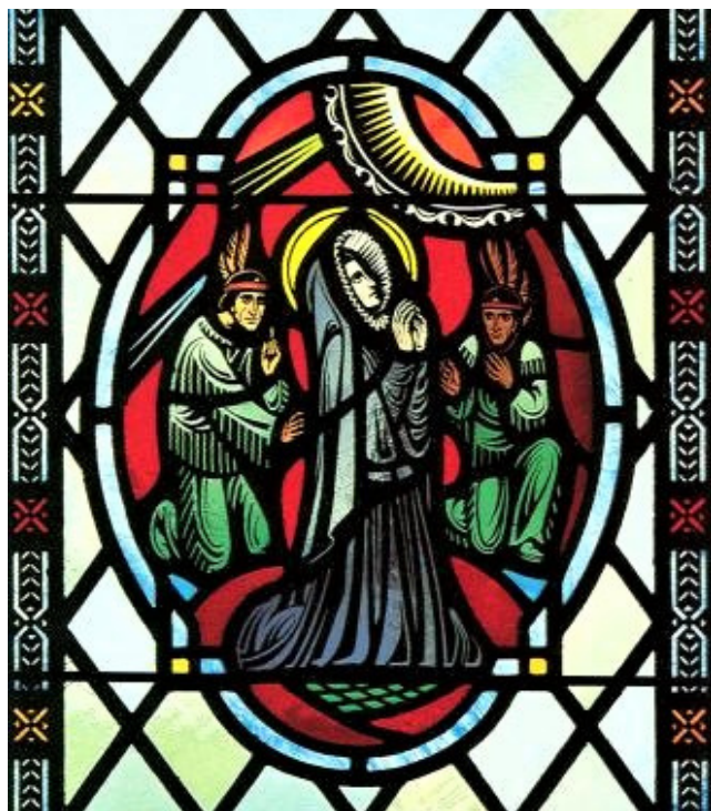
The stained-glass windows of Sacred Heart Church in Mound City depict the life and ministry of Philippine.

CONTACT: AASH is pleased to present a series of tours—in the United States and abroad—highlighting Sacred Heart history, heritage, and spirituality. If your group is interested in visiting one or more of the places on this suggested itinerary, please email nationaloffice@aash.org or call (314) 569-3948. We would be happy to work with you to organize a trip.