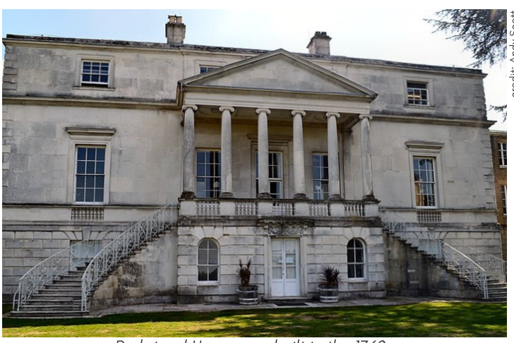
Parkstead House was built in the 1760s.