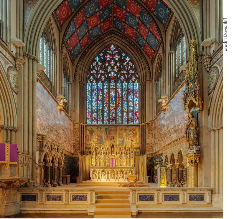
Interior of the Gothic Revival Church of the Immaculate Conception